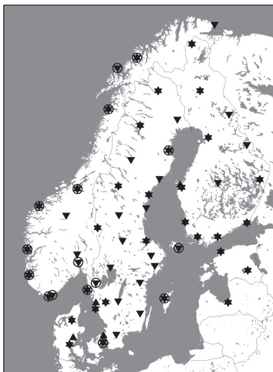
Figure 3. NGOS plan. Absolute gravity points (triangles), Nordic permanent GPS network (upside down triangles) and tide gauges (circles). All absolute gravity points are occupied with a GNSS instrument.

The Nordic countries have adopted national ETRS89-realizations as their national reference systems. NKG is responsible for one of the EPN analysis centres and the responsible organisation is currently the National Land Survey of Sweden. NKG has urged the countries for Nordic co-operation concerning the Nordic height systems.