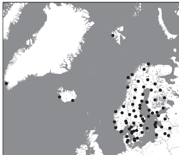
Figure 2. The geographical area covered by the NGOS and proposed NGOS stations.

The geographic extent of NGOS is currently defined as the Nordic countries, including Greenland and Svalbard (Fig. 2). It is recommended that the geographical region is extended to include also the area of Baltic States. This covers the area of the ice-covered part of the Northern Europe during the last ice age, and therefore the common geophysical interest.