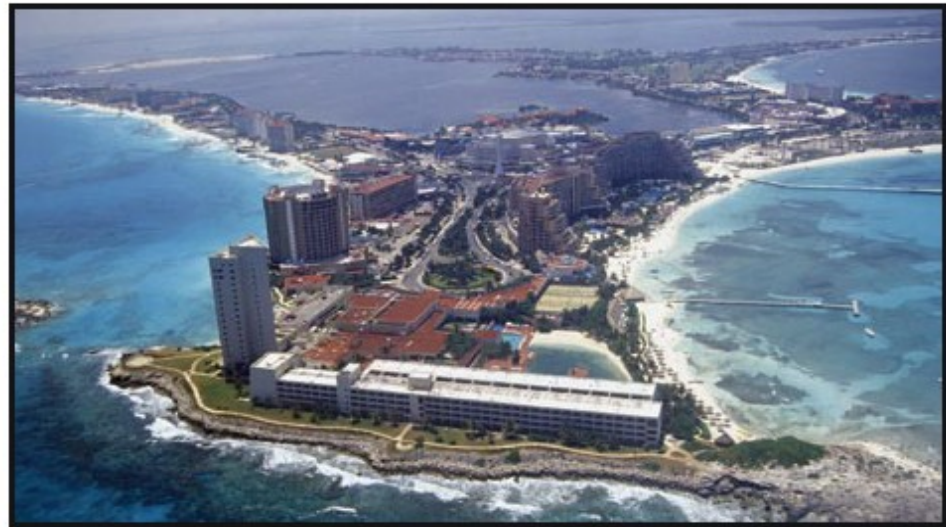
Figure 1.1. The Coastal Zone: Where inputs from land, sea, air and people converge

Heavily developed coast of Cancun, Mexico mostly for international tourism.